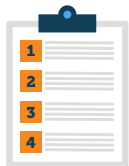
Priorities and Frameworks

In some districts, central office administrators played important roles in supporting school SEL efforts. These supports fell into five categories: