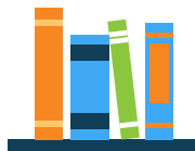
Programs and Curricula